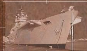
AIRCRAFT CARRIER - Massive tonnage, carries aircraft for a - Limited time operations. - Armed with anti-aircraft guns, depth charges and - surface-to-air, surface-to-surface missiles. - Operational in nearly all ocean theaters. - Should be always first, with morale, armor, crew, - vulnerable in close combat where its guns, cannot - be utilized for defense.