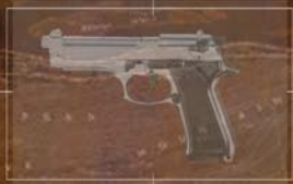
M1911 PISTOL Caliber: .45 Length: 5.5 Weight: 3 lb. 14 ounces Standard issue weapon for US Military Officers A primary weapon and powerful, accurate.

'd20 System' and the 'd20 System' logo are trademarks of Wizards of the Coast, Inc. and are used according to the terms of the d20 System License version 6.0. A copy of this License can be found at www.wizards.com/d20 .