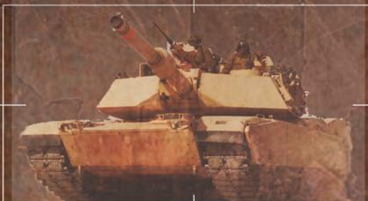
M1A1 ABRAHAM DANK - Ultimate armored vehicle (best armor) (best gun) (best fire speed) - Long-ranged targeting, remote-controlled interior, satellite - communication system. - Features combat predictor. - Single most advanced combat armored vehicle in the world.